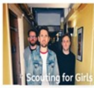
Scouting for Girls

24 - 28 May 2024 | Weston Park, Shropshire